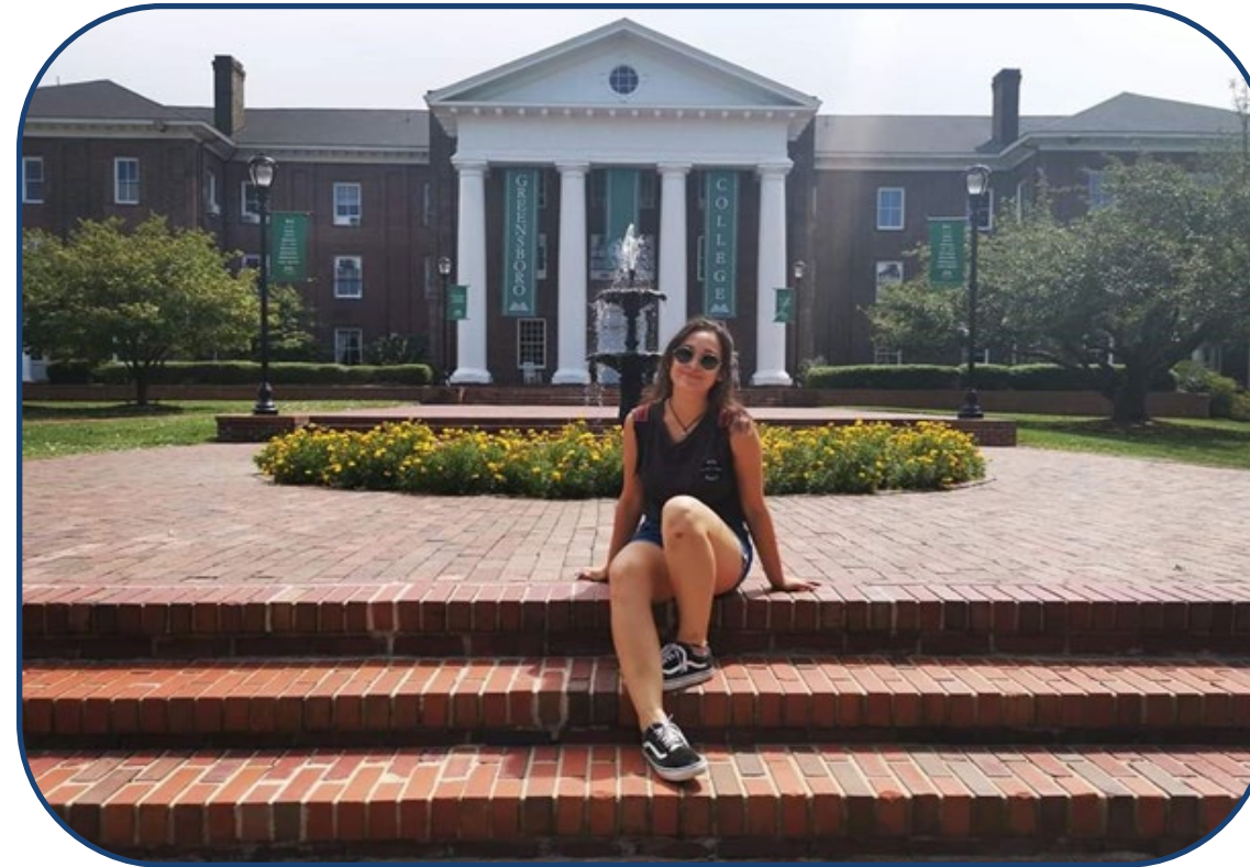
Greensboro College, North Carolina