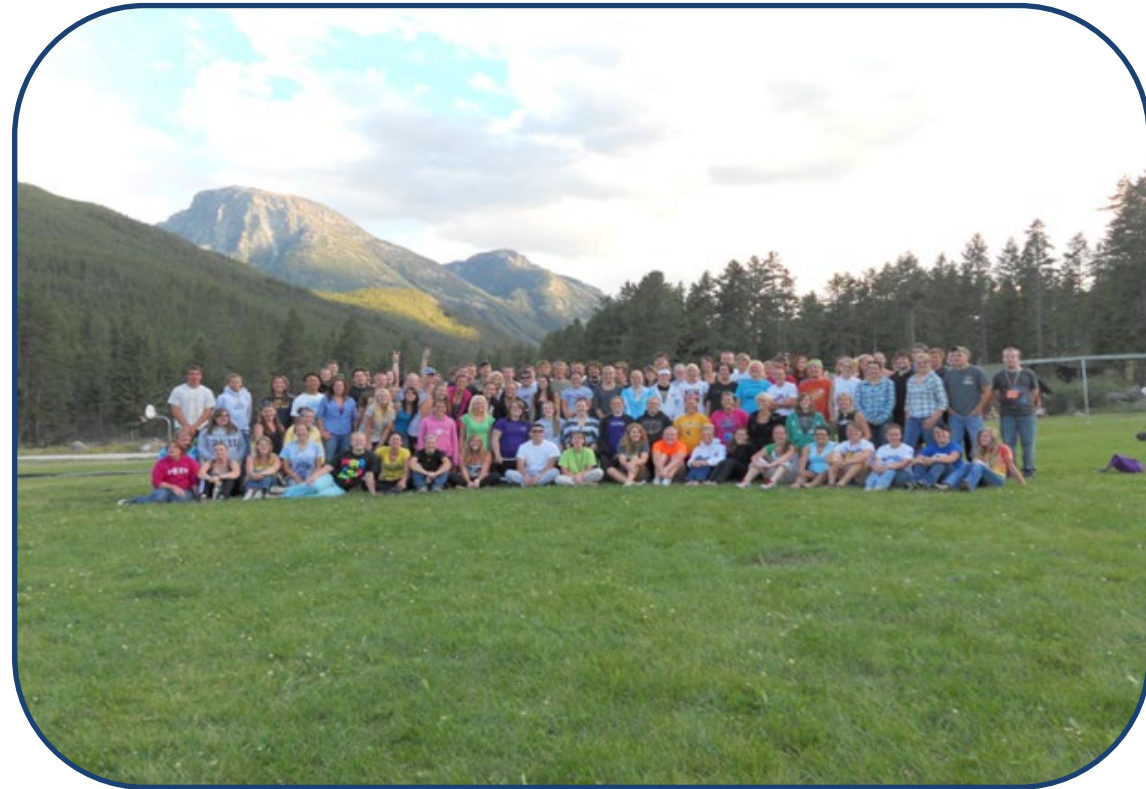
Rocky Mountain College, Montana